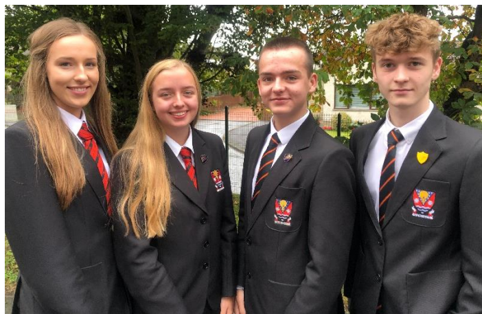
School Captains for 2019-20