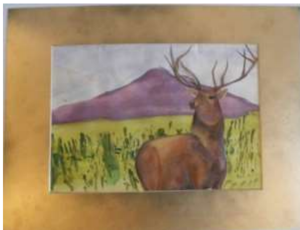
Examples of art and technical work