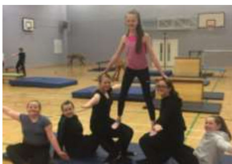
Various school activities