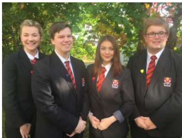
School Captains for 2017-18

Every session, we appoint two School Captains, a girl and a boy from S6. Vice captains are also elected from S6. Pupils are nominated and speak to an assembly of S6 pupils and staff. S6 pupils and teachers then vote and the Captains and Vice Captains are duly elected. House Captains are elected from S6 and House Vice Captains are elected from S5. They represent the school at various events, help teachers and pupils in all sorts of ways and act as role models for younger pupils. Prefects from S5 and S6 are chosen by the Senior Management Team and the Pupil Support Team. These are pupils who have shown leadership skills and, again, have shown that they are excellent role models.